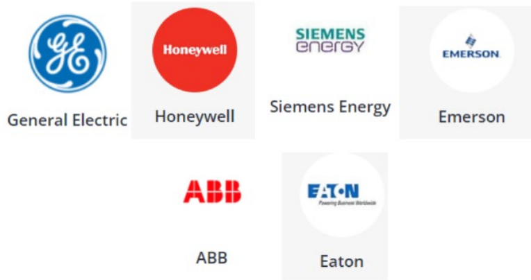
Exhibit 2: Key Competitors of Schneider Electric