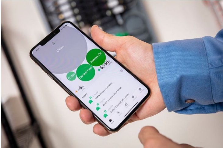
Exhibit 5: The Schneider Sense Application