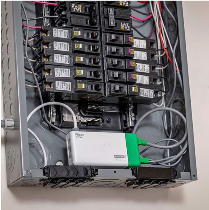
Exhibit 3: The Schneider Whole House Surge Protector