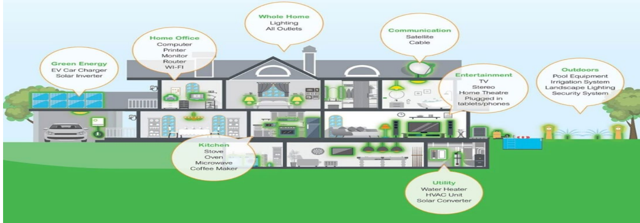
Exhibit 1: Typical Surge Protected Devices