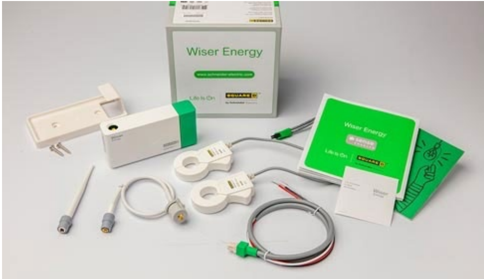
Exhibit 4: The Schneider Wiser Energy™ system