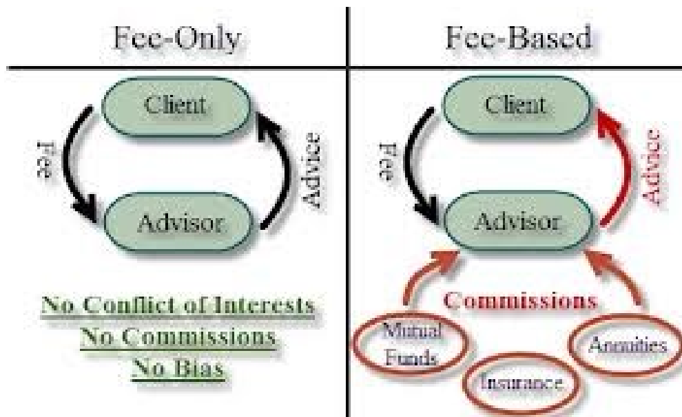
Exhibit 2: Fee Only vs. Fee Based Financial Advisories