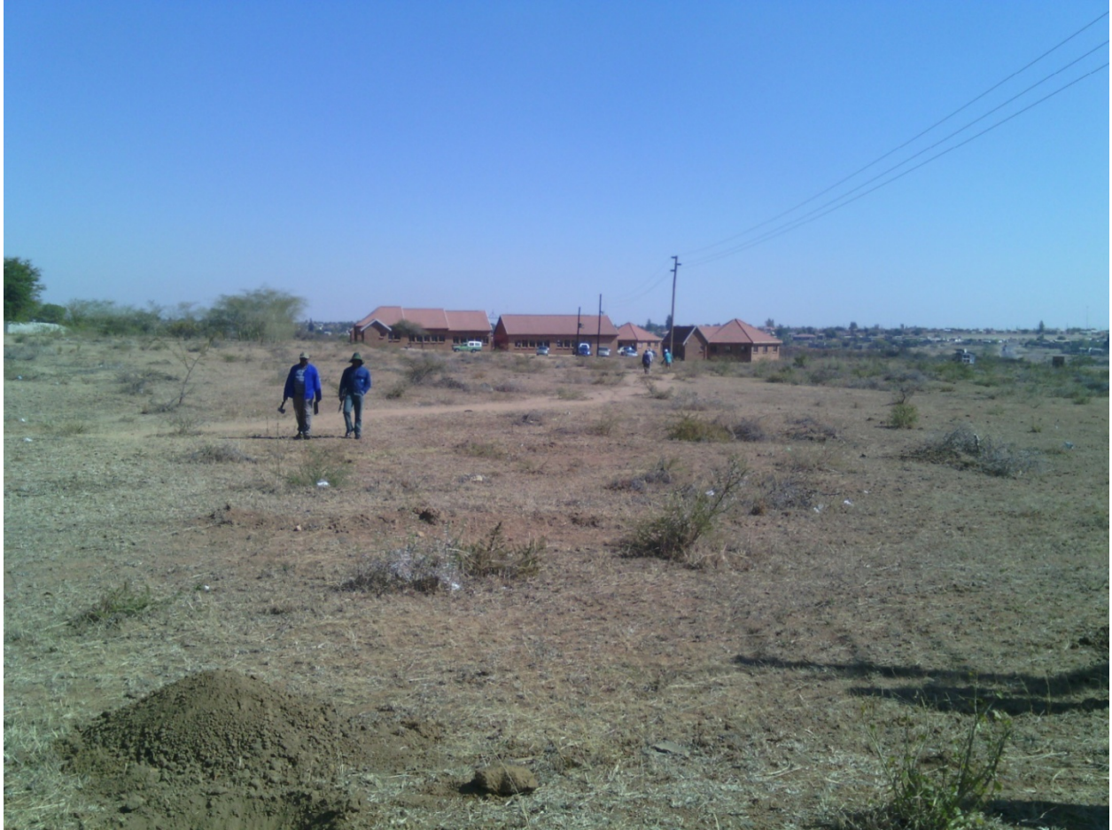
Exhibit 1: A Photo of the SEIDET Campus