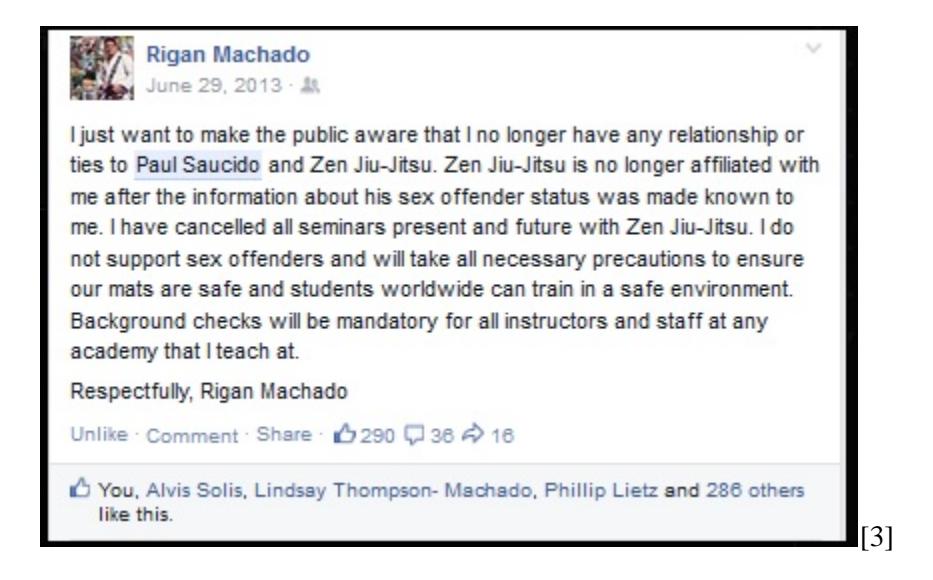
June 2013 - Machado disavows Saucido

Previous belt ranks were granted to Saucido by 8th degree black belt Rigan Machado, considered a legend by many in the Brazilian Jiujitsu world. In 2013, once word of Saucido's conviction became known, Machado disavowed all connections with him: